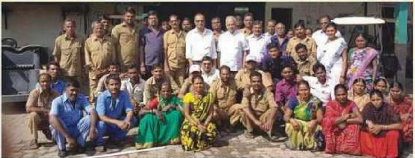
THE PRESIDENT AND THE CAPTAIN WITH THE GREENS TEAM

Post the successful CG Open 2016, the president and the captain had a special afternoon with the entire greens team.